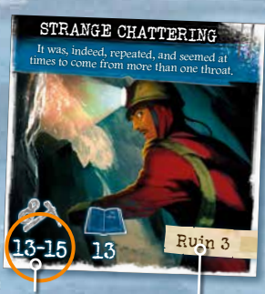
Equipment Symbols (4 different)